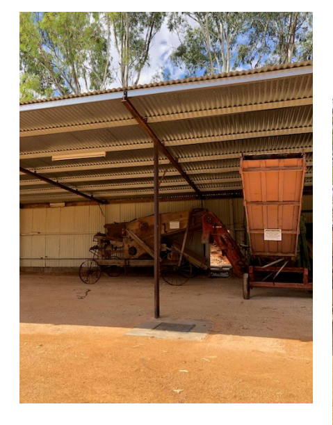
The Agriculture Shed is a long.....