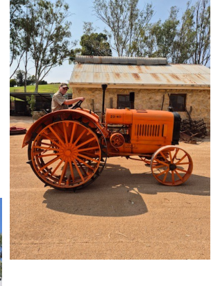
Even the Case Buckboard has had an airing (although there is still more work to be done on it before it runs smoothly)