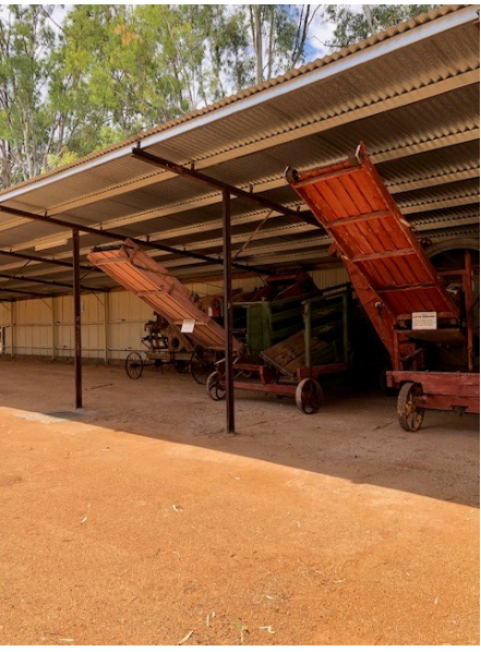
...very slow process ...