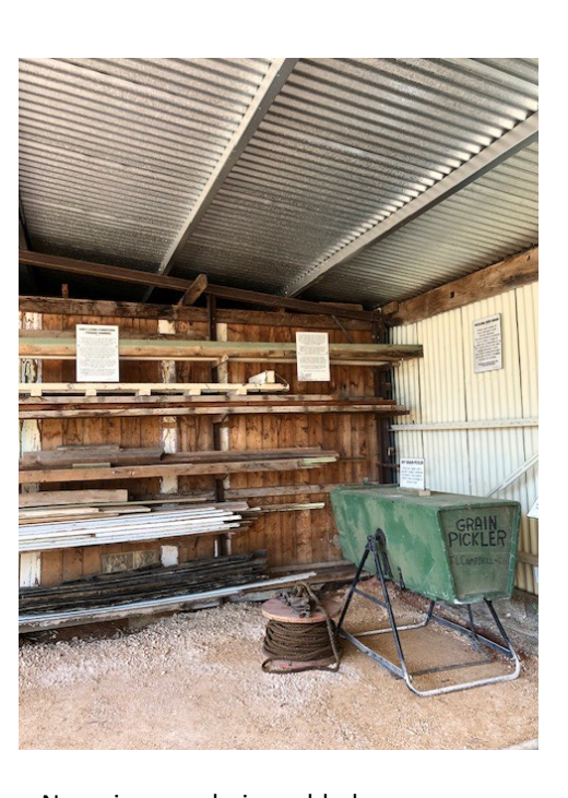
... New signs are being added as we go ... telling the story of the farming life in the past and how the machines work.