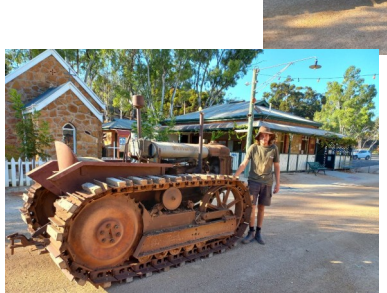
"And others just keep on keeping on"